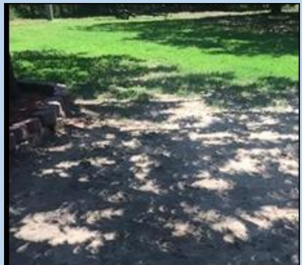
Sun filtering through leaves can make a myriad of sun images Try laying a white sheet on the ground under the tree.