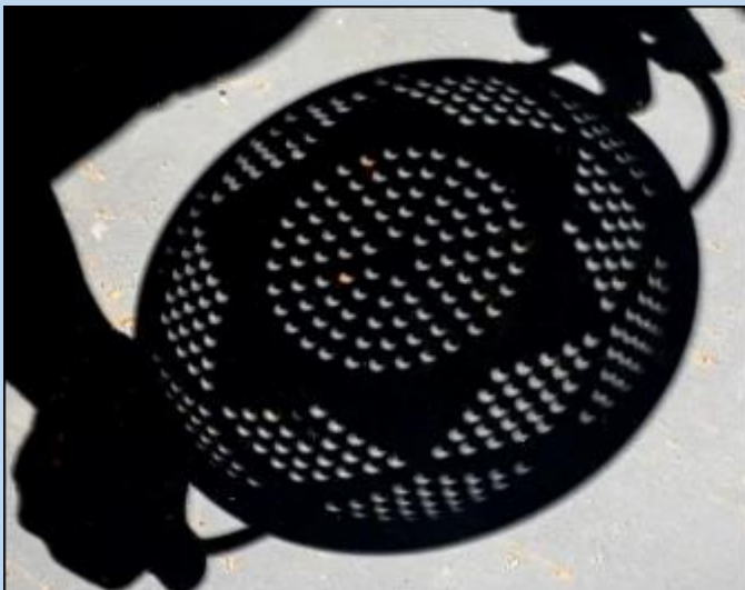
Use a kitchen colander to project dozens of tiny of eclipsed suns