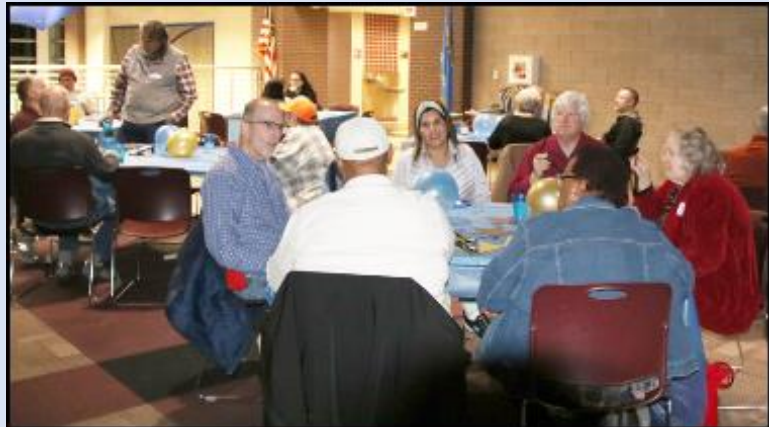
Enjoying eating together