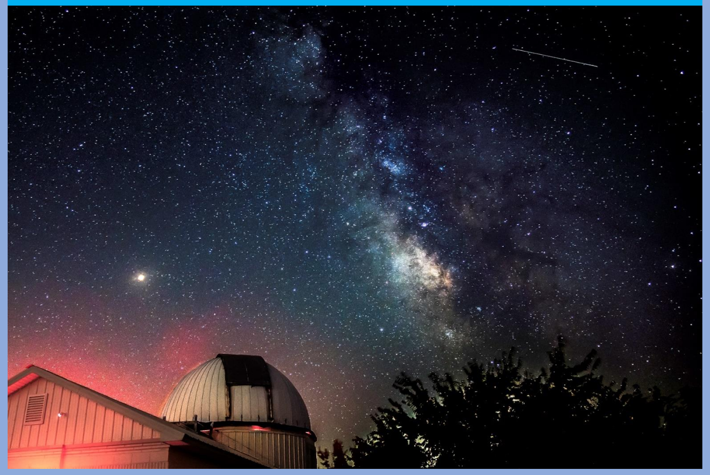
at our Observatory Sept 1, 2018 Center of Milky Way in Sagittarius / Scorpius region with bright Mars on the left.

Are you tired of dreary days and cloudy nights?