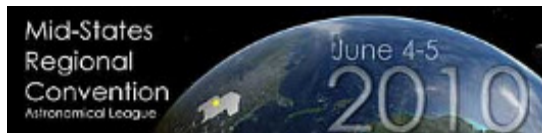
MidStates Regional convention June 4- 5, 2010 Lincoln, Nebraska http://msral.org/