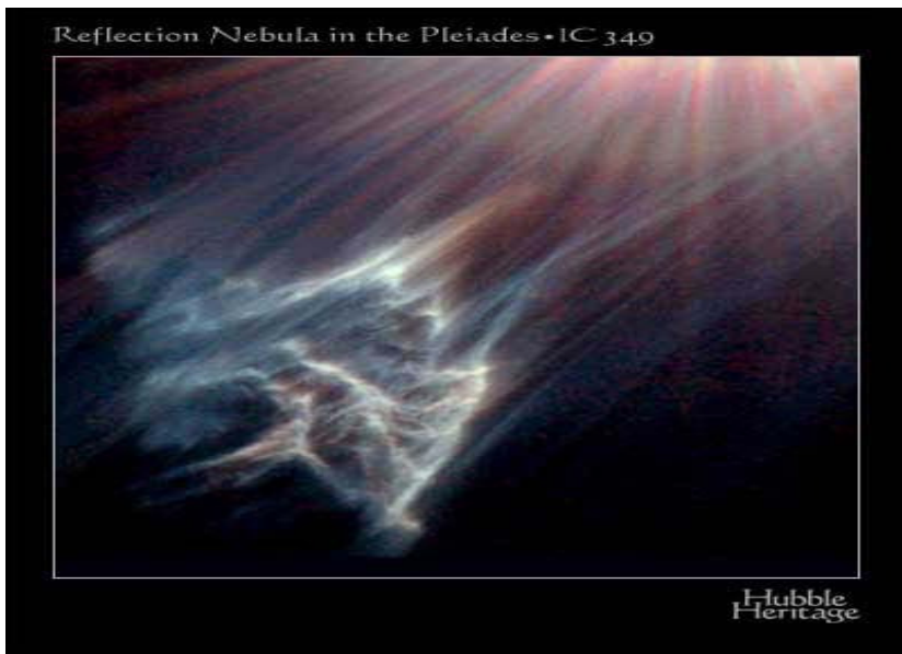
PRC00-01 Space Telescope Science Institute NASA and The Hubble Heritage Team (STScI)

Send your astronomy image to ACT_PM@astrotulsa.com to have it featured here in future issues!