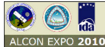
National Astronomical League Convention June 25-26, 2010 Tucson, AZ Side trips include tours of Kitt Peak national observatory http://alcon2010.astroleague.org/