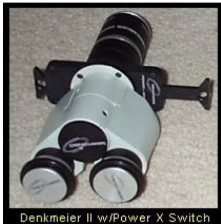
Denkmeier II w/Power X Switch