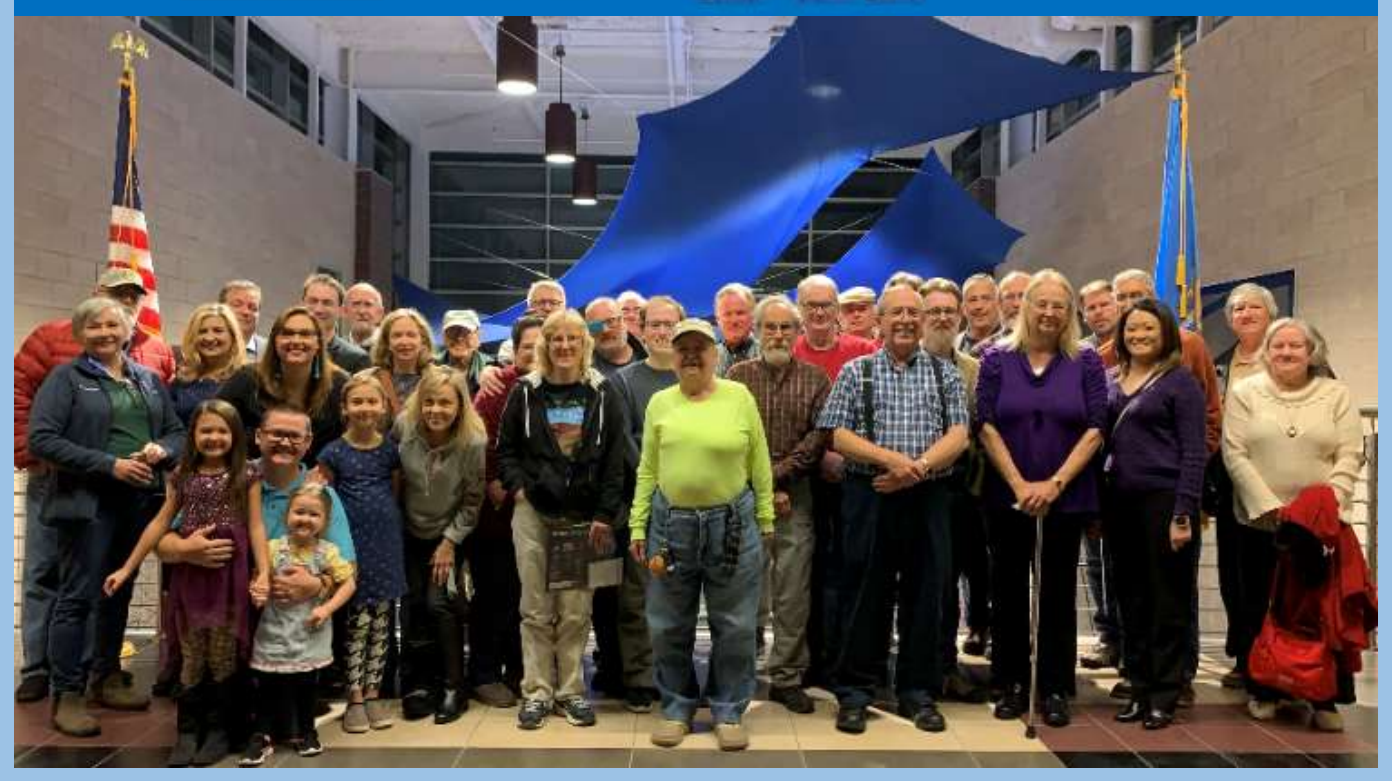
55 members & family attended our Annual Club Dinner Nov 2